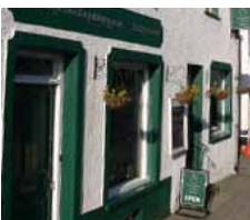
Broughton Broughton Village Bakery Princes St Broughton in Furness Cumbria LA20 6HQ.

The Sunday meetings commence from 9.30am and frequently we depart at 11am on an ad-hoc ride out. Please read postings on the Forum for any suggested ride-out routes.