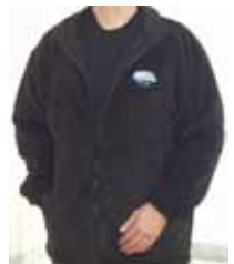
Fleece Jacket £18.00 (+£3.50 p&p)