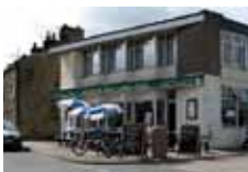
Lancaster Cafe West Quay Glasson Lancaster LA2 0BZ