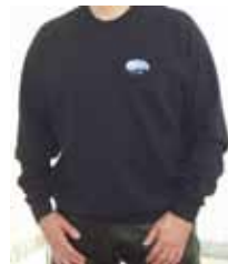
Sweatshirt £15.00 (+£3.50 p&p)