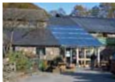
Staveley Wilf's Cafe Mill Yard Staveley LA8 9LR