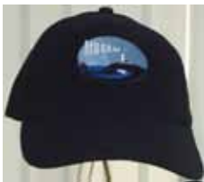
Baseball Cap £5.50 (+£2 p&p)

See http://www.mbeam.org.uk/merchandise/ for further details or to place your order online.