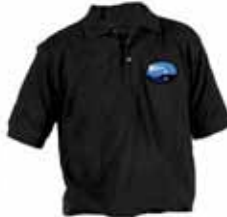
Polo Shirt or T-shirt £13.50 or £9 (+£2.50 p&p)